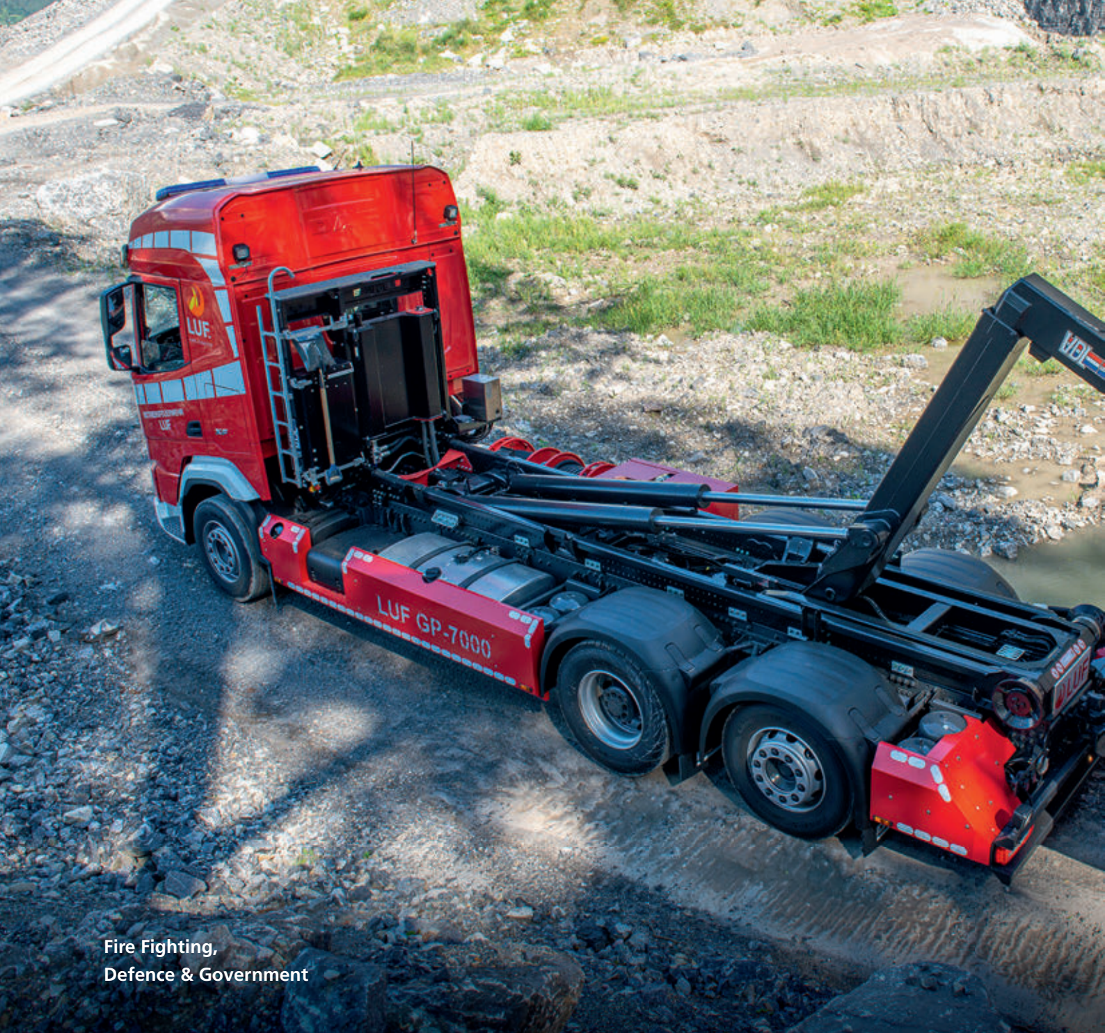
Fire Fighting, Defence & Government