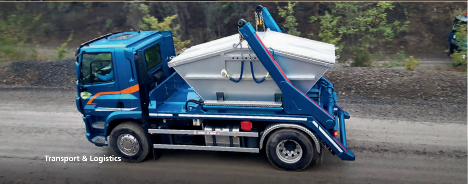
Transport & Logistics