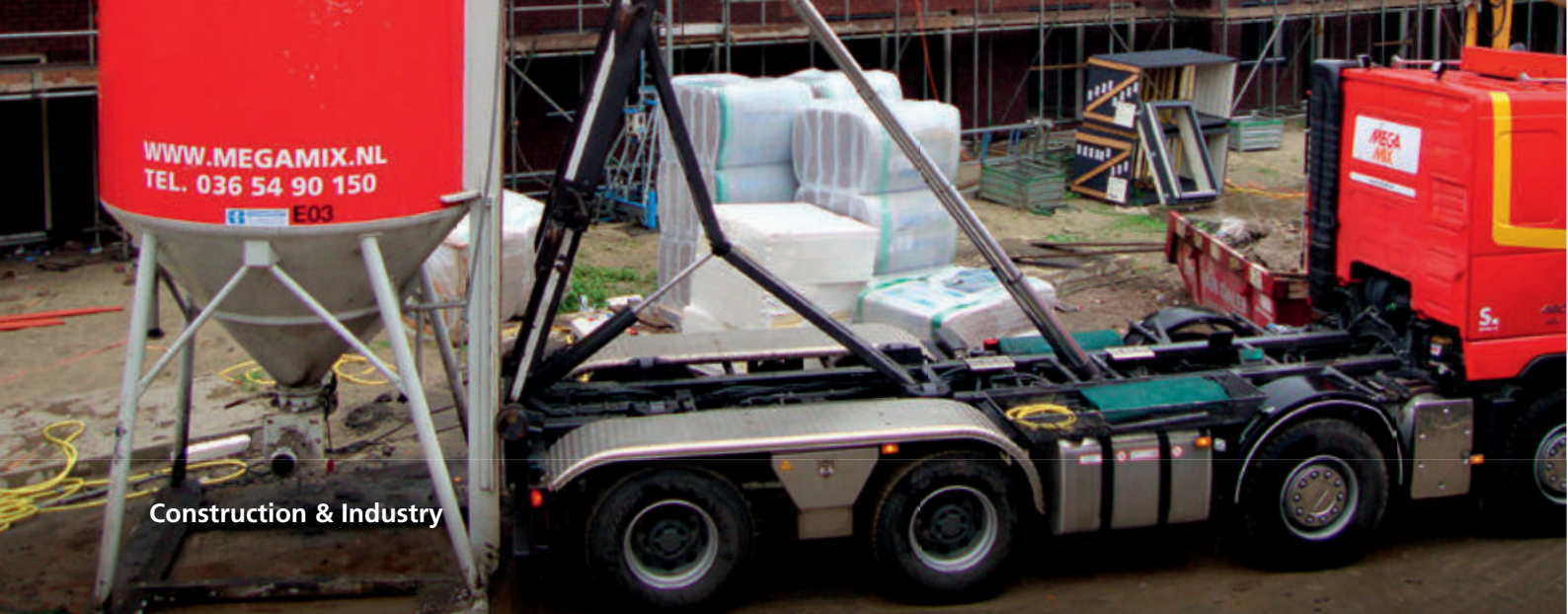
Construction & Industry